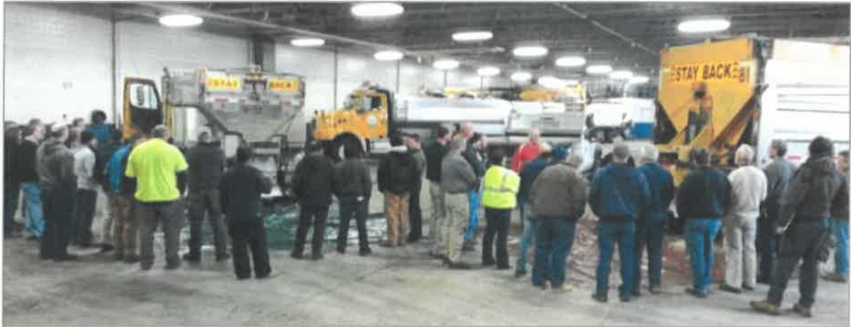
Calibration Workshop Attendees, November 18 th , Wheaton, IL

The general agenda for the morning included information on calibration and why it is important then hands on demonstrations for an open loop (no compensation for changes in vehicle speed), closed loop (compensation for vehicle speed) and electronic system. Participants rotated through the “stations” in two groups.